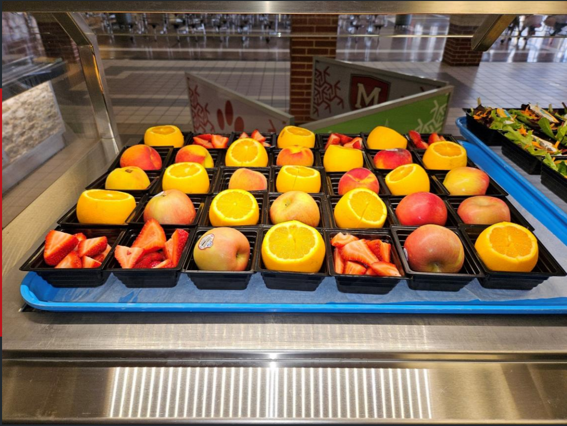
Magnolia ISD– Brothers Produce