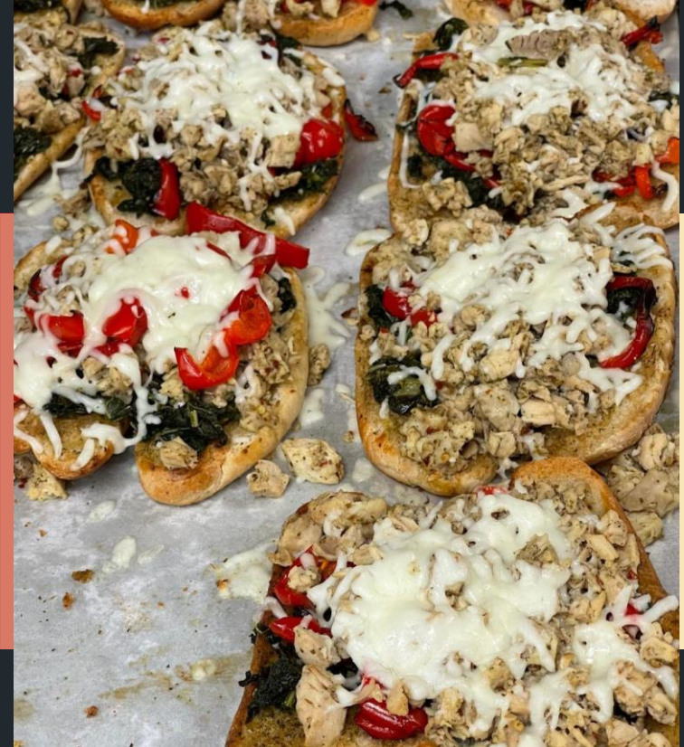
Florence ISD-Val Verde Kale via Labatt